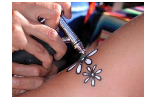
Air Brush Tattoo Artist $800