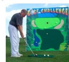
Golf Challenge $180