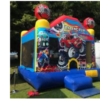
Racing Car Bounce $600

**Sponsorship requests are processed in order received**