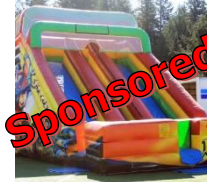
Extreme Slide $1200