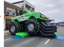
Monster Truck Combo $1000