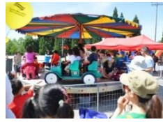
Carousel $ 1700