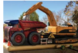
Construction Obstacle $1400