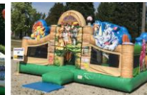
Zoo Playland $800

*Sponsorship items may change subject to availability*