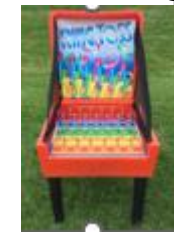
Ring Toss $100