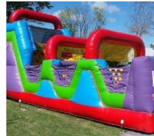
Wacky Obstacle $1400