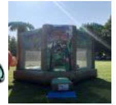
Jungle Safari Bounce $600