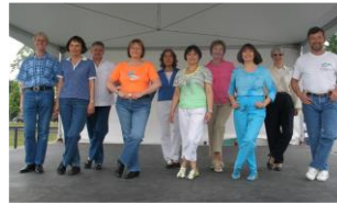
Main Stage + Tent $6500