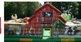
My Little Farm $800