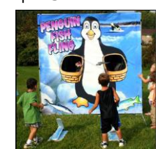
Penguin Fish Fling $180