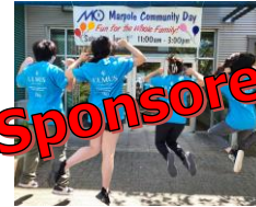
Festival T-Shirts $2625