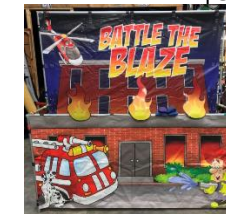
Battle the Blaze $180