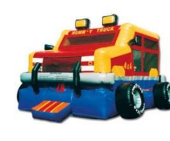
Monster Wheels Bounce $600