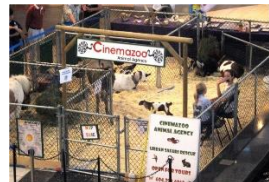
Petting Zoo $1300