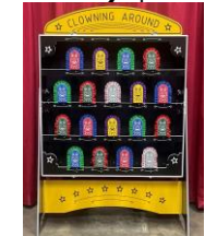
Clowning Around $275