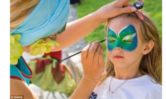
Face Paint Artist(s) (3 available) $550 each