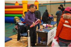
Balloon Artist(s) (3 available) - $550 each