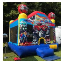
Racing Car Bounce $600