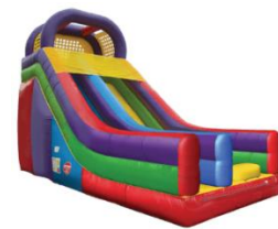
Wacky Slide $1000