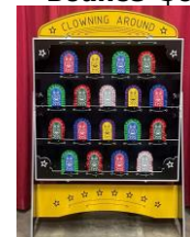
Clowning Around $275