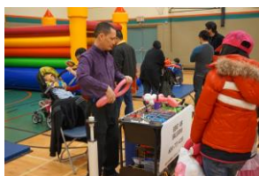
Balloon Artist (s) (3 available) $550 each