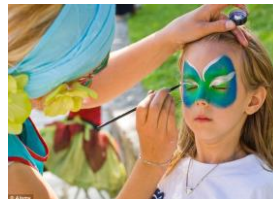
Face Paint Artist (3 available) $550 each