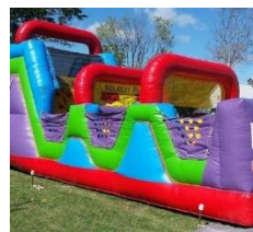
Wacky Obstacle Course $1400