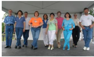
Main Stage+Tent $6500

*Costs and Inflatables/rides may change subject to availability. Sponsorship requests are processed in order received*