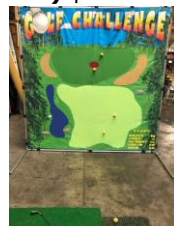
Golf Challenge $180