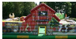
My Little Farm $800