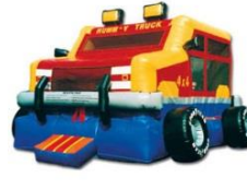
Monster Wheels Bounce $600