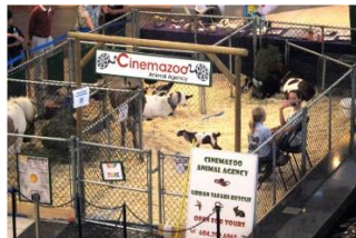
Petting Zoo $1300