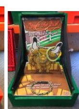
Rope the Bull $100