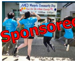
Festival T-Shirts $2625