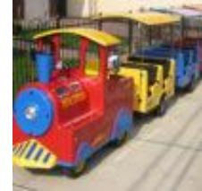
Express Train $1400