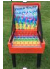
Ring Toss $100