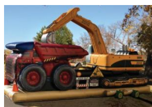
Construction Obstacle Course $1400