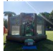
Jungle Safari Bounce $600