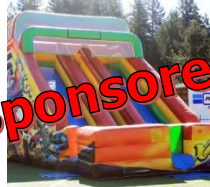
Extreme Slide $1200