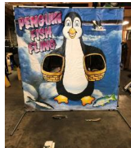
Penguin Fish Fling $180