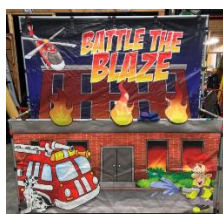
Battle the Blaze $180