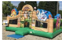
Zoo Playland $800