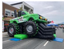
Monster Truck Combo $1000